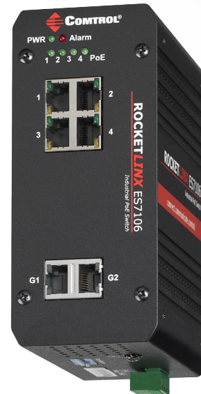
Part Number 32047-0

For more detailed information visit www.comtrol.com/rocketlinx